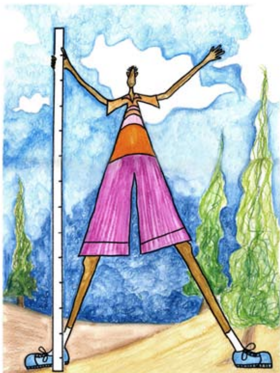
Illustration by Sandy Coleman

the Quarterly team worked on this issue of the magazine. All of the features highlight individuals who ask a great deal of themselves in order to offer the world as much as they can.