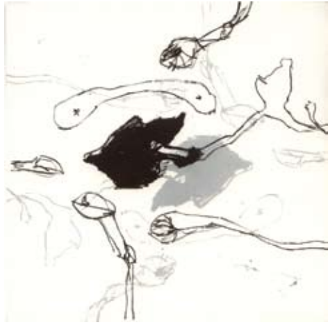
Roberta Delaney, Reflected Shadows , 1/5, lithograph, 8 x 8 inches, 1994-5, Gift of Roberta Delaney (2002.006n)

nors to the collection is extremely important and valued, this exhibition focuses on twenty-two in particular. Gifts from these individuals or families can be categorized in one or more of five ways; these categories and their respective donors are listed on the following pages. Without these patrons, the Wheaton College Permanent Collection would not be the remarkable teaching resource it is today, as it would not be as large or as eclectic. Both factors are beneficial to a liberal arts college like ours, as our students and faculty have diverse interests, many of which can be served by the collection.