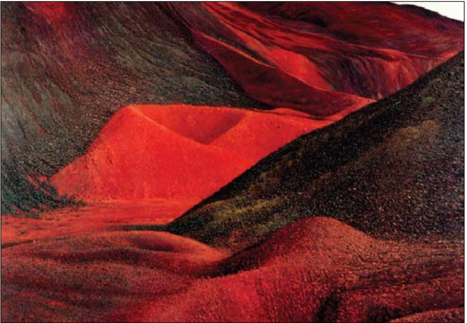
Vaino Kola, Volcanic Matter #2 , oil and acrylic on canvas, 52 x 66 inches, 1992, Purchased with the Eliot Fitch and Christine Price Bartlett '46 Art Fund (92.008)